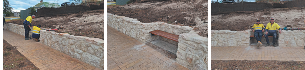
Penneshaw Crew installing the bench